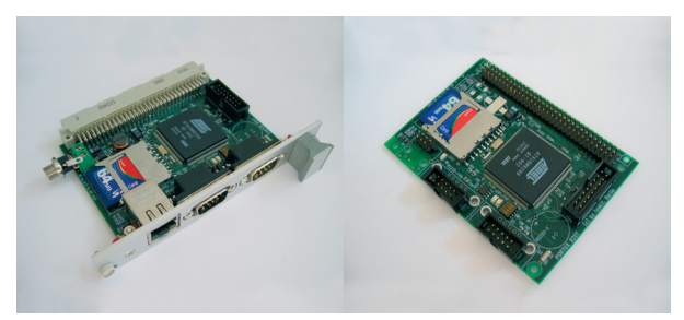
Eurocard version (I.) and Sandwich version (r.)

Self-developed hardware thus remains CPU-card independent. Integrated components of the AT91RM9200 can also be used via the PXB: USART 2 and 3, USB Host/Client, CompactFlash, I²C bus, TWI and SPI. Altogether, 32 I/O ports are available, though they are multiplxed with integrated components. The actual number of I/O ports thus depends on the configuration. The PIF bus, a universal 8-bit bus for simple connection of your own components, is also integrated into the PXB.