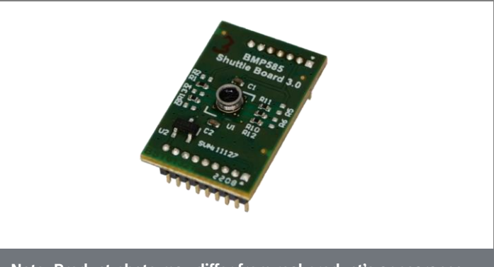
Note: Product photo may differ from real product's appearance

The Bosch Sensortec BMP585 shuttle board 3.0 is a PCB with the pressure and temperature sensor BMP585 mounted on it. In combination with the application board 3.0, the shuttle board can be used to evaluate various functionalities provided on BMP585. The shuttle board allows easy access to the sensor pins via a simple socket and can be directly plugged into the Bosch Sensortec's application board 3.0.