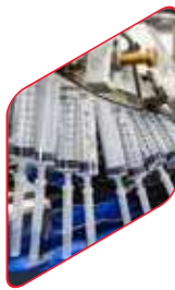
Writing Batch ID & individual S/N