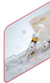
Link to Shipping information