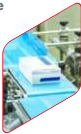
RFID with default ID