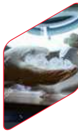
Checking Batch ID & individual S/N