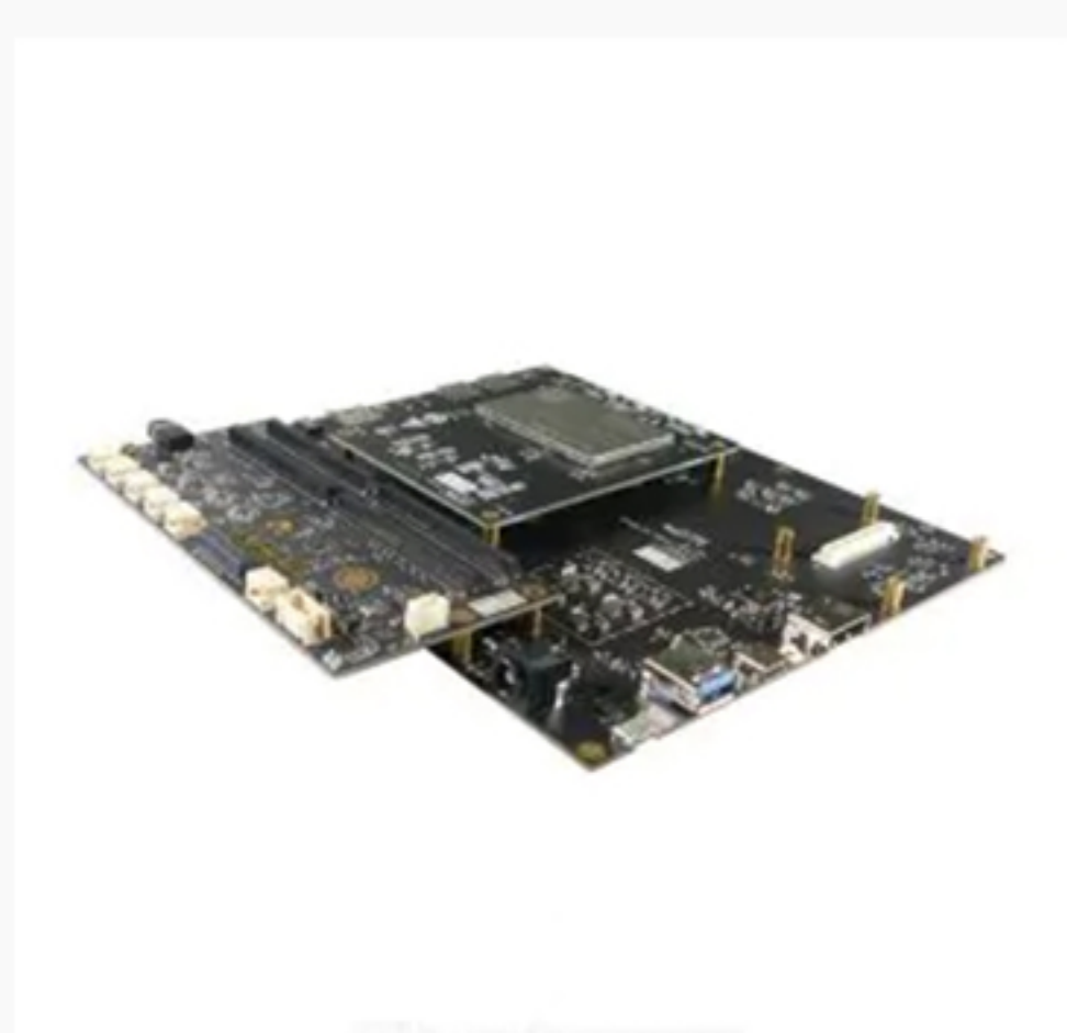
CM2290/C2290 Development Kit