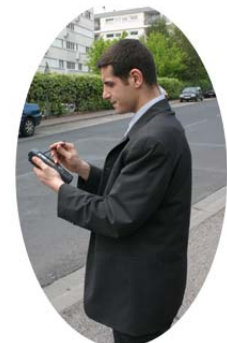
Indispensable field tools for wireless mesh sensor networks