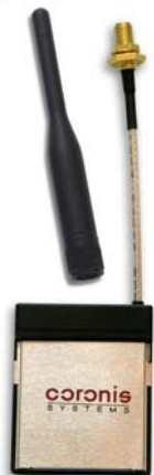
Available with external antenna connector for custom integration and ruggedized readers

With its Win 32 DLL and Active X drivers, there's no limit to the applications you can use with Waveport. Our fully documented application programming interfaces (APIs) allow you to write custom applications to meet your exact needs, and to configure Waveport's internal parameters and services to match your installed network nodes. Frequency hopping (FHSS) and data interleaving ensure robustness and interference-free wireless operation. From network configuration and administration to walk-by data monitoring, Waveport provides a robust connection to the entire line of Wavenis-powered solutions.